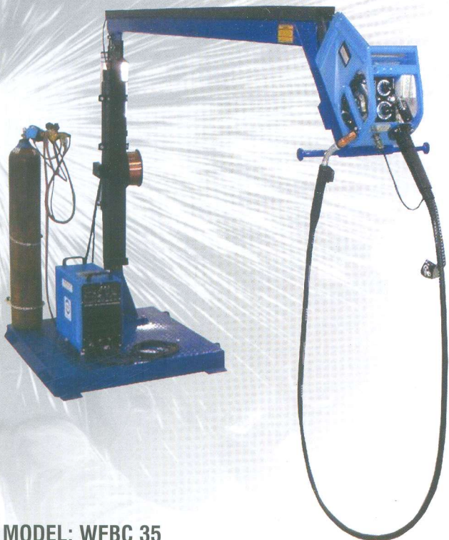
MODEL: WFBC 35

Consistency in quality & service 30 Years